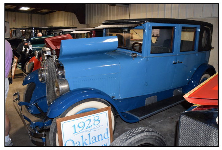
A NC 1928 Oakland and below a NC 1927 Buick Sedan.