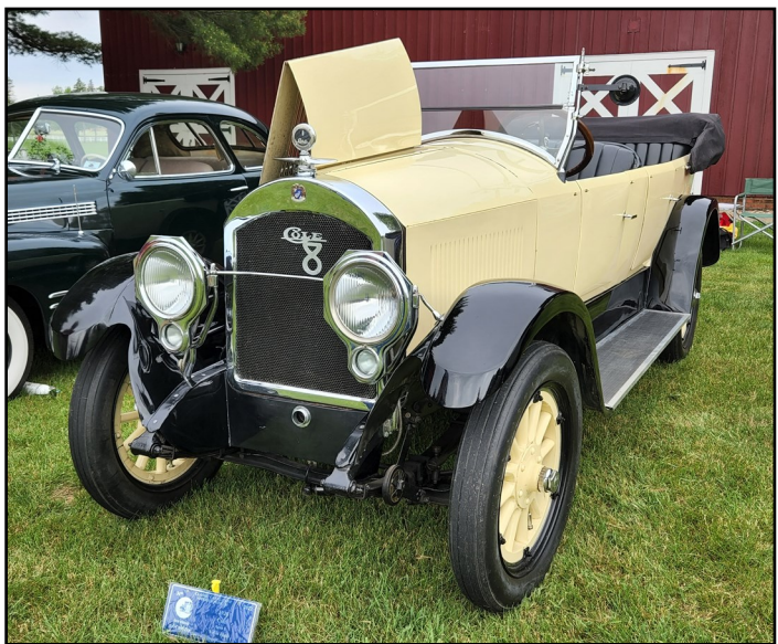
A rare Cole Touring on display at Gilmore.