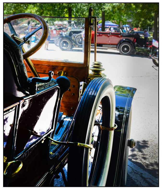
A view of our HCCM Easter Concours Pre-WII Best of Show winning 1909 Auburn Touring (NC) toward-Wendell Smith's Classic PI Rolls-Royce at the HCCM Father's Day Show.