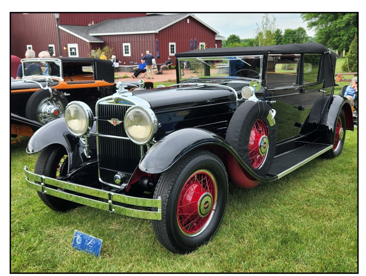
A Stutz convertible sedan.