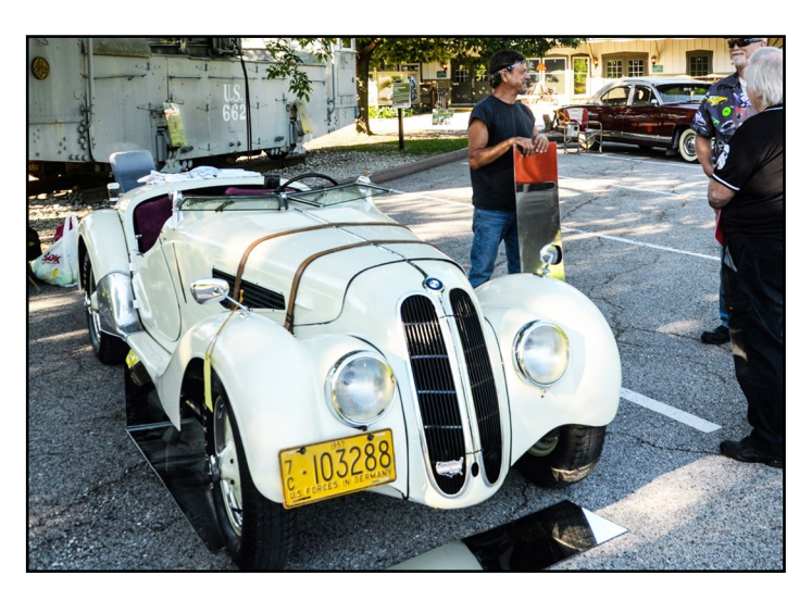
This BMW 328 won Best of Show on Father's Day.