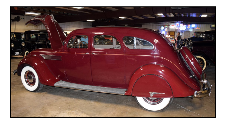
The Nolan's beautiful Full Classic 1935 Imperial C2