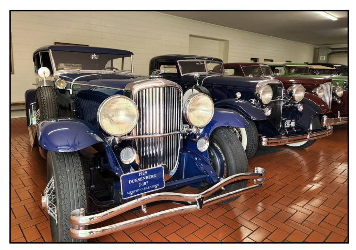
Some of the great cars featured in the Bill Parffet Collection.