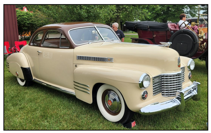
A 1941 Cadillac 62 Coupe.