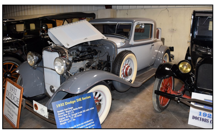
Above: A row of NC antiques and a NC 1932 Dodge.