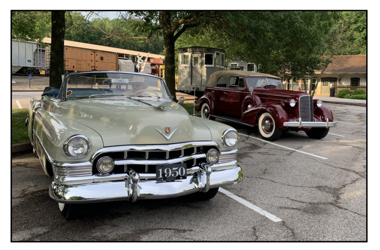
Non-Classic 1950 Cadillac 62 Convertible and Classic 1936 Cadillac Fleetwood Convertible Sedan.