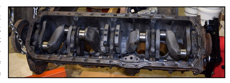
The crankcase and 116 pound crankshaft of the 320 cubic-inch Buick Straight Eight Engine.

The real lesson from this is if you have never built an en-Since I have built a few engines including two 1928-1931 gine don't be afraid to give it a try. There are lots of people to Model A Fords (NC), a couple of Rolls-Royce Silver Wraiths help and lots of information available. It is very satisfying and a place of great pride and accomplishment when you can tell someone that you built and gave birth to the powerplant in your Classic Car. Jim Schild