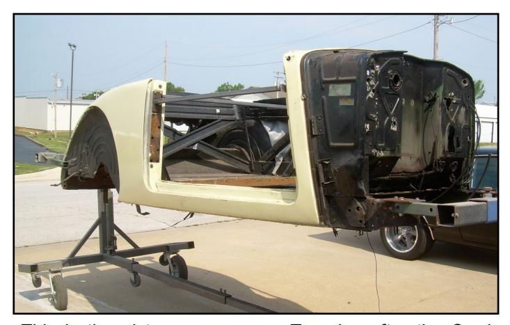
This is the picture we saw on Tuesday after the Cord was delivered to Buffalo on the previous Thursday. Note the 1" x 1" steel braces in the totally stripped body.