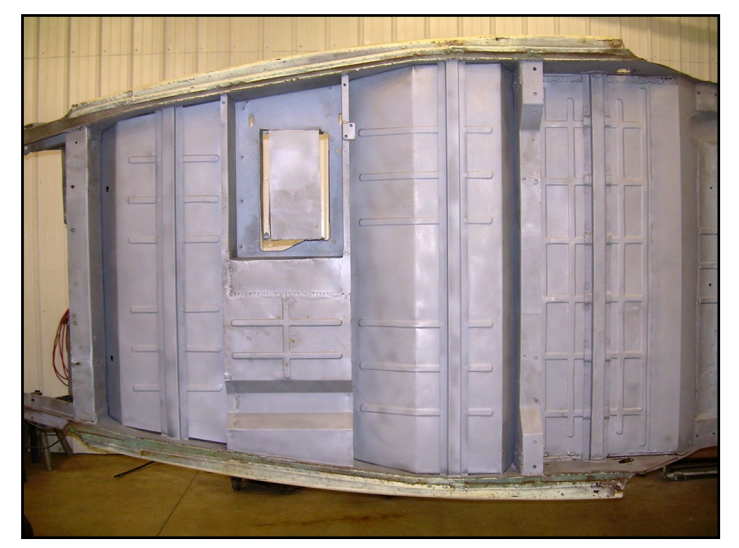
The 1936 Cord after all new pressed steel floor pans were welded in place by the guys at Buffalo Paint & Body. Everything is almost perfect at this point.