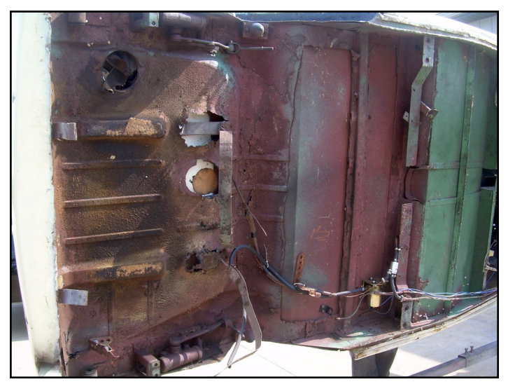
Another view of the Cord body and the butchering done to convert it to rear-wheel drive at some point..