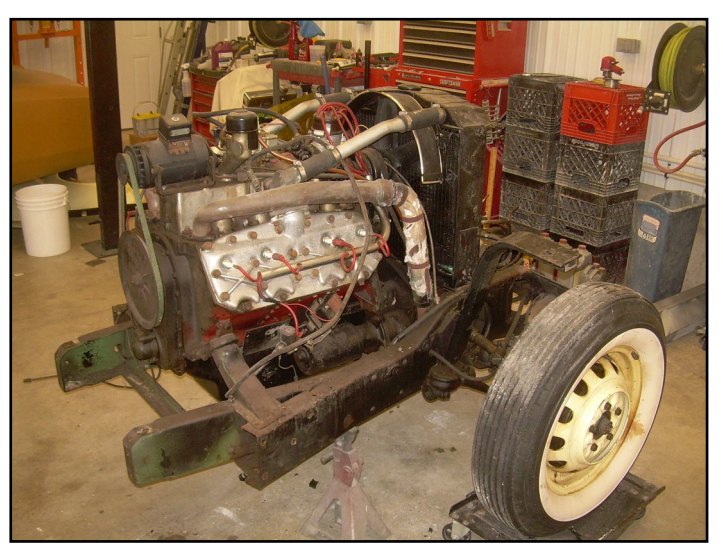
The entire front sub-frame had to be removed to properly restore the underside and structure of the 1936 Cord 810 body. It is held together with twenty bolts.

As soon as possible Myrna and I transported the Cord down to Buffalo and after dropping it off we told them we would also like them to restore the previously messed up firewall and paint it and the steering column Cigarette Cream and instrument panel Ramada Red in acrylic urethane. We left the car in Buffalo on a Thursday afternoon and by the following Tuesday we were sent pictures of the Cord already disassembled and on the rotisserie.