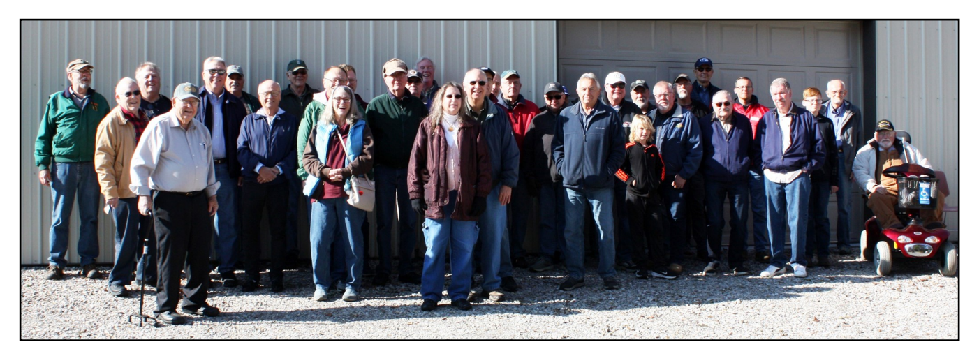
Friday Tour Group