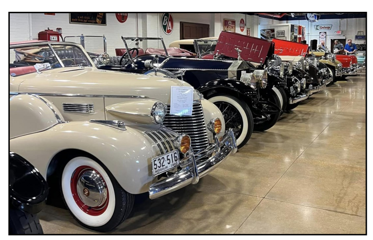
More cars from the Kirberg Collection. Top : A row of mostly Full Classic Cars. Below : A 1919 Locomobile..