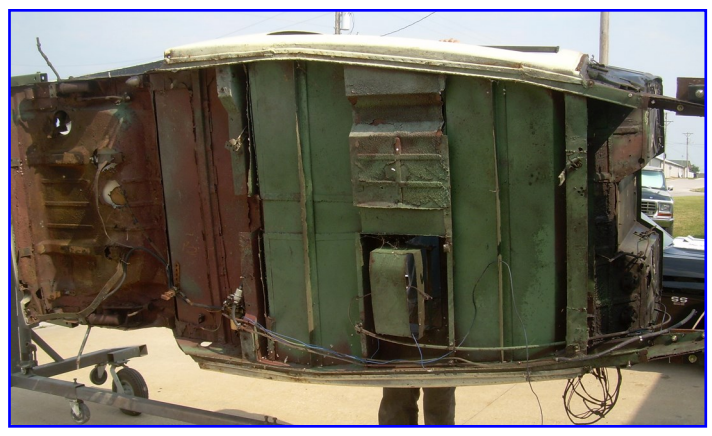
The underside of the 1936 Cord body shows the extremely poor condition, rust and ugly porch green paint that at one time covered the entire car. This Cord had been hiding in the St. Louis area since the 1940's and was unknown to Cord historians.