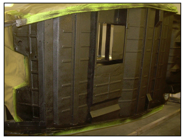
The underside of the Cord body was sprayed with black pickup bed liner material which is virtually indestructible. This replaced the original black undercoating that had been applied when the car was built at Connersville.

This is where the title of this little article comes in. It was clear in the pictures that these young men knew what they were doing when I noticed the one-inch square steel tubing braces welded and bolted between the door jambs and across the body width. Once the old floor pan was removed from the body there would be little left to provide strength as the work was completed. It is important for any job like this, especially a convertible, to maintain the body in a solid and square position so nothing can move around. If you don't see this structure while someone is working on your similar car or body in this condition you should quickly find another shop to complete the job properly.