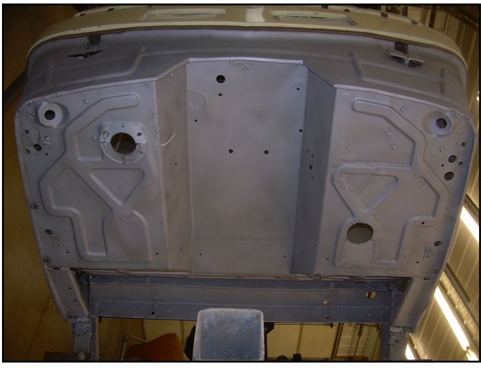
While the body was disassembled we told the guys at Buffalo to repair and restore the firewall according to detailed drawings were got from Stan Gilliland in Kansas.