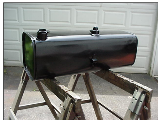
Finished tank ready for installation on car.