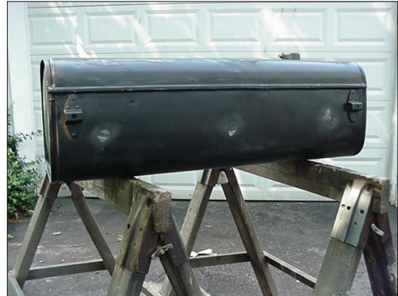
Note where one inch holes were cut into tank then rewelded.

I later sanded the paint off and redid the paint myself.